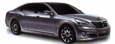
Hyundai EQUUS Sedan